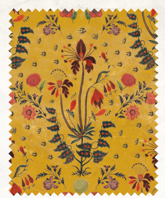
GYPSY Ochre Heavy linen / #FB00002