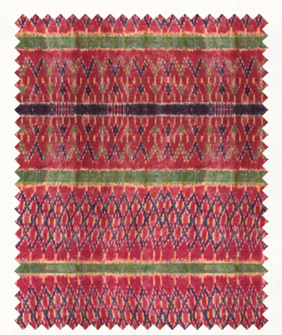
LAKAI Heavy linen / #FB00004