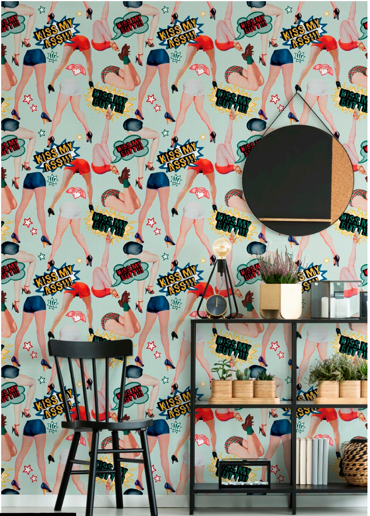
NOUVELLE POP KISS MY ASS #WP20378