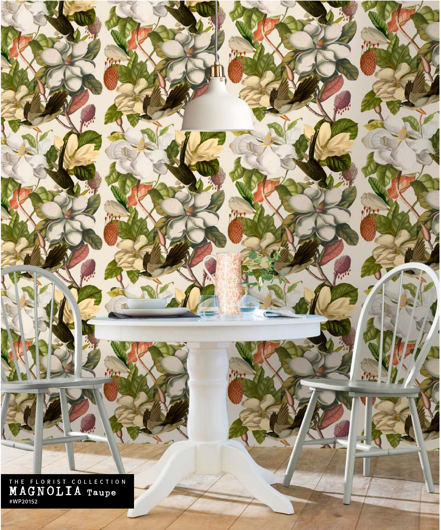
THE FLORIST COLLECTION MAGNOLIA Taupe #WP20152