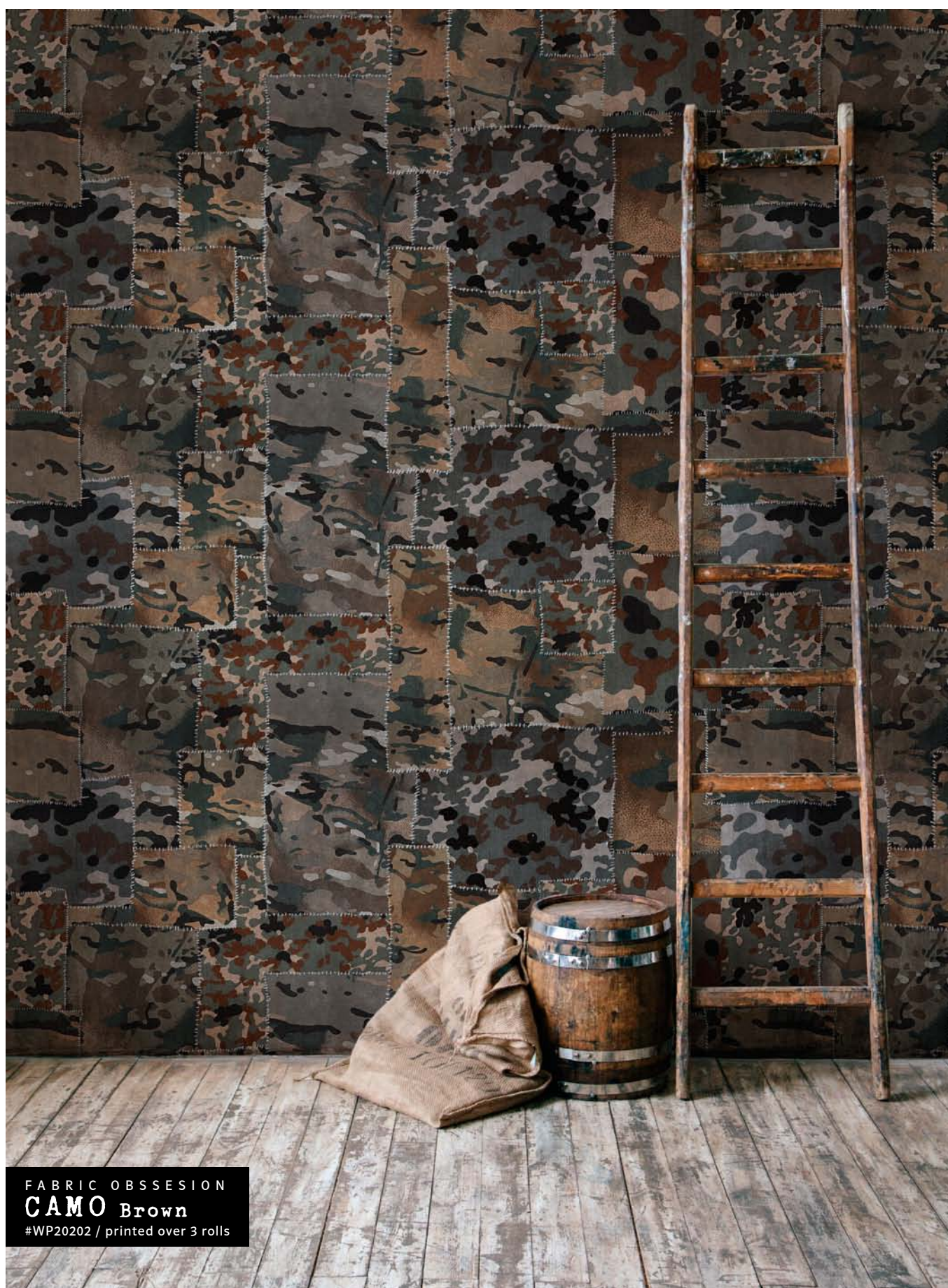
FABRIC OBSESSION CAMO Brown #WP20202 / printed over 3 rolls